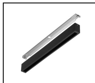
Terrano surface frame black mat RAL9005 573x38x60 (420948)