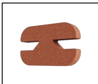
Terra Balance connector set 2 pcs BRN01 (806957)