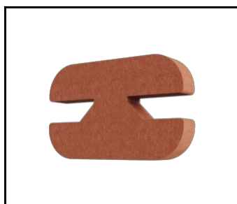
Terra Balance connector set 2 pcs BRN01 (806957)