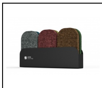
Terra Balance - PET panel colour chart (807015)