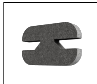
Terra Balance connector set 2pcs GRAYM (806940)