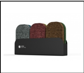
Terra Balance - PET panel colour chart (807015)

Card creation date: 25 April 2025 The company reserves the right to make design changes or upgrades in the presented product. Product data sheet does not constitute an offer. * Parameter tolerance is +/- 10%