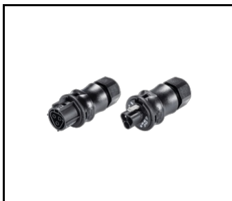
Tuba IP69K 3P connector set (778254)