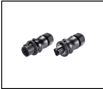
Tuba IP69K 3P connector set (778254)