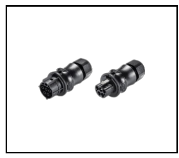
Tuba IP69K 3P connector set (778254)