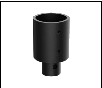
SKVER external adapter fi60 (804588)