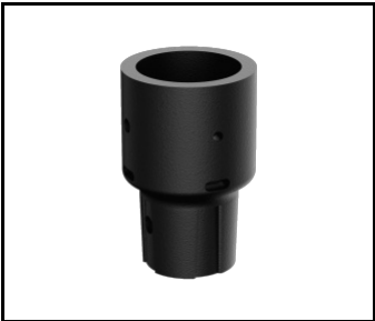
SKVER external adapter fi48 (804571)