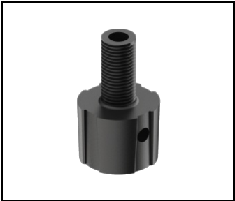
SKVER R male adapter thread M20x40 (pitch 2.5) (804427)