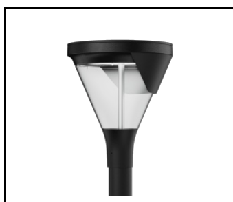
SKVER Backshield RAL9005 (435515)