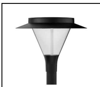
SKVER Hood example 1 RAL9005 (435522)