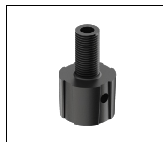
SKVER R male adapter thread M20x40 (pitch 2.5) (804427)