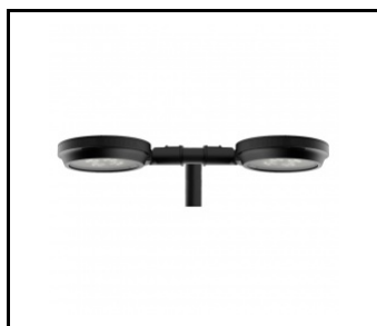
T-type boom RAL9005 structure 88.9x5 + 2x 60.3x2.9 (150098)