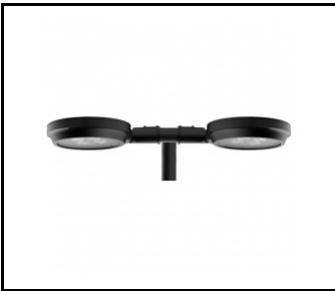
T-type boom RAL9005 structure 88.9x5 + 2x 60.3x2.9 (150098)