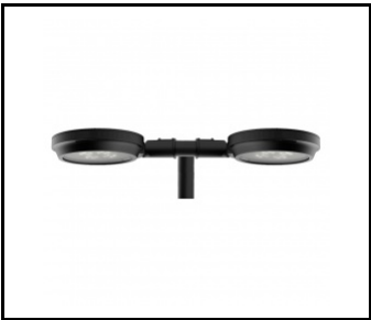
T-type boom RAL9005 structure 88.9x5 + 2x 60.3x2.9 (150098)