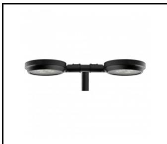
T-type boom RAL9005 structure 88.9x5 + 2x 60.3x2.9 (150098)