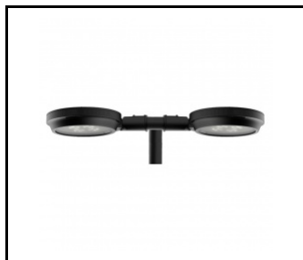
T-type boom RAL9005 structure 88.9x5 + 2x 60.3x2.9 (150098)