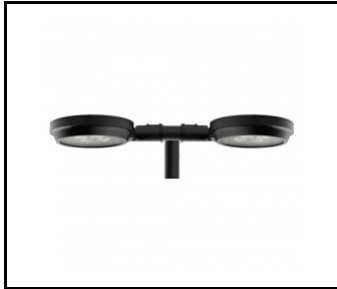
T-type boom RAL9005 structure 88.9x5 + 2x 60.3x2.9 (150098)