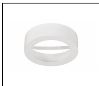
Round surface casing - white. 15W (059858)