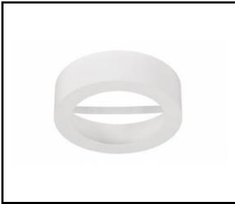
Round surface casing - white. 15W (059858)