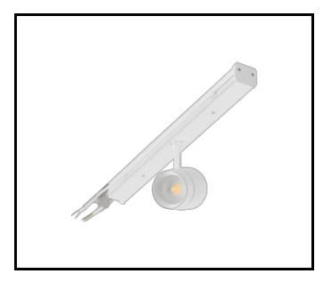
LINEA S LED ECO 588mm - 1xEXPO ADJUST 2050lm DALI zoom 22-55st. White 840 20W (594465)