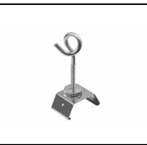
LINEA S LED chain pendant (981425)