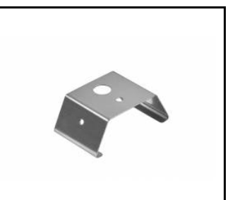
Linea S LED surface mount bracket (980954)