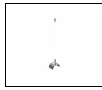
LINEA S LED hang 1.5m (981173)