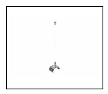
LINEA S LED hang 1.5m (981173)