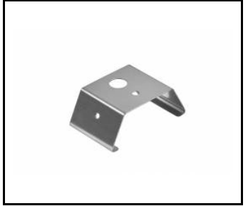
Linea S LED surface mount bracket (980954)