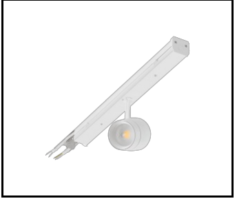
LINEA S LED ECO 588mm - 1xEXPO ADJUST 2050lm zoom 22-55st. White 840 20W (594472)