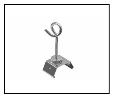
LINEA S LED chain pendant (981425)