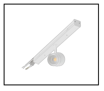
LINEA S LED ECO 588mm - 1xEXPO ADJUST 2050lm DALI zoom 22-55st. White 840 20W (594465)