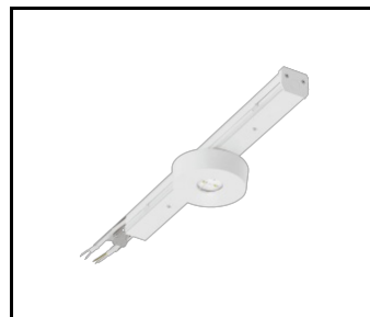
LINEA S LED ECO 588mm 260lm AW DOT CS 2W 1h NM AT (594458)