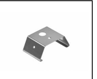
Linea S LED surface mount bracket (980954)