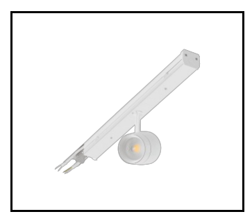
LINEA S LED ECO 588mm - 1xEXPO ADJUST 2050lm DALI zoom 22-55st. White 840 20W (594465)