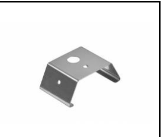
Linea S LED surface mount bracket (980954)