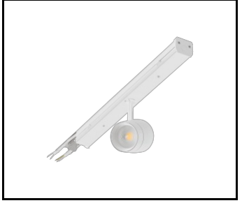
LINEA S LED ECO 588mm - 1xEXPO ADJUST 2050lm zoom 22-55st. White 840 20W (594472)