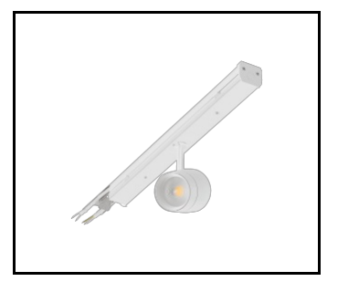
LINEA S LED ECO 588mm - 1xEXPO ADJUST 2050lm DALI zoom 22-55st. White 840 20W (594465)