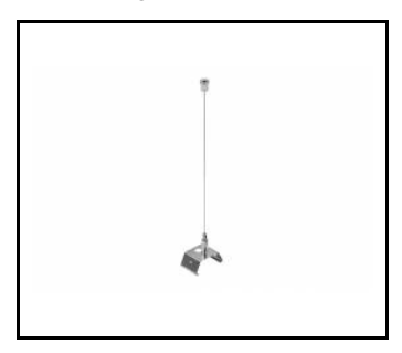
LINEA S LED hang 1.5m (981173)