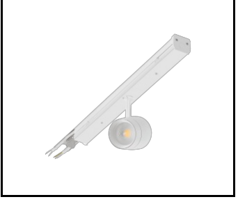
LINEA S LED ECO 588mm - 1xEXPO ADJUST 2050lm zoom 22-55st. White 840 20W (594472)