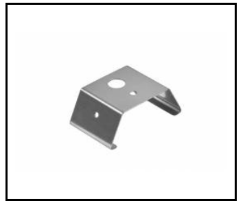
Linea S LED surface mount bracket (980954)