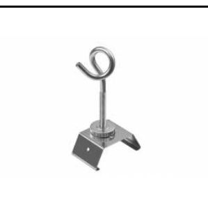
LINEA S LED chain pendant (981425)