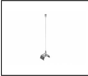
LINEA S LED hang 1.5m (981173)