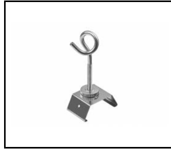
LINEA S LED chain pendant (981425)