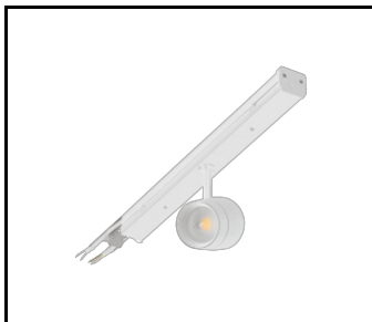
LINEA S LED ECO 588mm - 1xEXPO ADJUST 2050lm DALI zoom 22-55st. White 840 20W (594465)