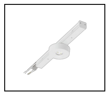
LINEA S LED ECO 588mm 260lm AW DOT CS 2W 1h NM AT (594458)