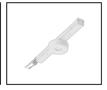
LINEA S LED ECO 588mm 260lm AW DOT CS 2W 1h NM AT (594458)