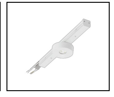
LINEA S LED ECO 588mm 260lm AW DOT CS 2W 1h NM AT (594458)