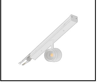
LINEA S LED ECO 588mm - 1xEXPO ADJUST 2050lm zoom 22-55st. White 840 20W (594472)