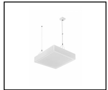
CONTRA LED suspension system 600x600 (374685)