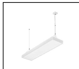
CONTRA LED suspension system 1200x300 (374692)