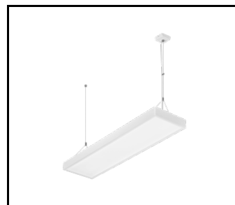
CONTRA LED suspension system 1200x300 (374692)