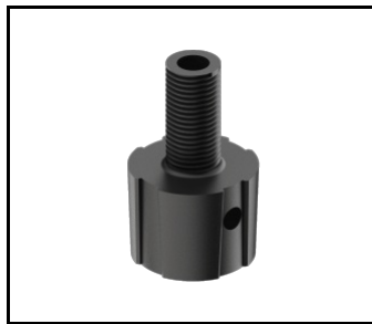
SKVER R male adapter thread M20x40 (pitch 2.5) (804427)