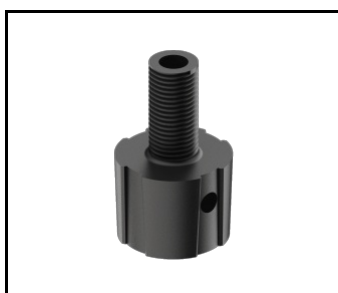
SKVER R male adapter thread M20x40 (pitch 2.5) (804427)