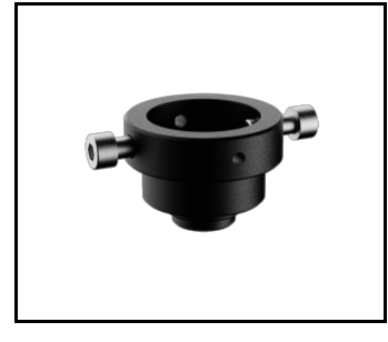
Drilling pattern (449017)