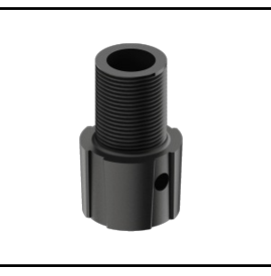
SKVER R male adapter thread 1 inch x40 (gas) (804434)