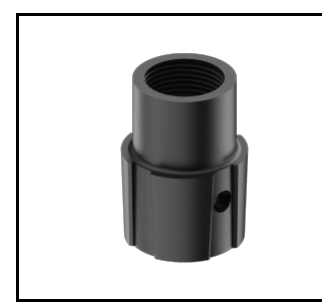
SKVER R female adapter thread 1 inch x40 (gas) (804441)