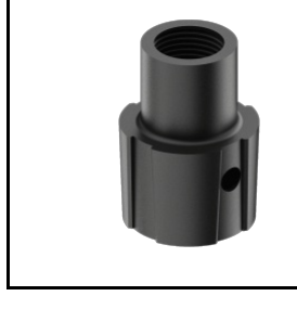
SKVER R female adapter thread \frac{3}{4} inch x 40 (gas) (804335)