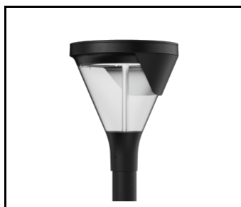
SKVER Backshield RAL9005 (435515)