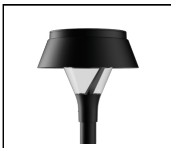
SKVER Hood ULR example 2 RAL9005 (421518)