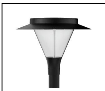
SKVER Hood example 1 RAL9005 (435522)