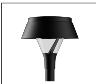
SKVER Hood ULR example 2 RAL9005 (421518)