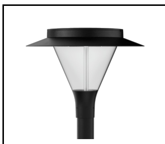
SKVER Hood example 1 RAL9005 (435522)