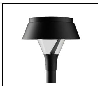
SKVER Hood ULR example 2 RAL9005 (421518)