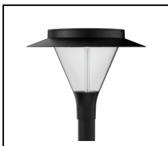
SKVER Hood example 1 RAL9005 (435522)