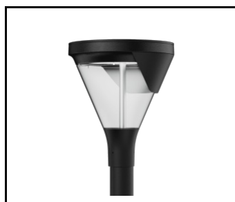
SKVER Backshield RAL9005 (435515)