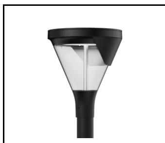
SKVER Backshield RAL9005 (435515)