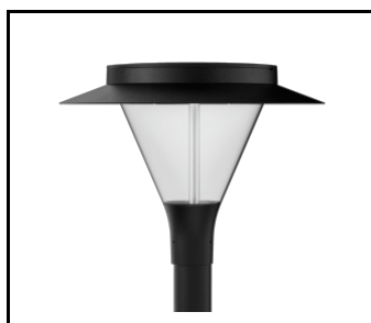
SKVER Hood example 1 RAL9005 (435522)