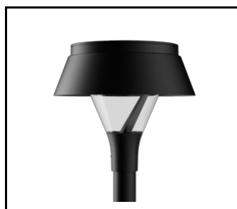
SKVER Hood ULR example 2 RAL9005 (421518)