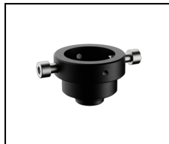
Drilling pattern (449017)