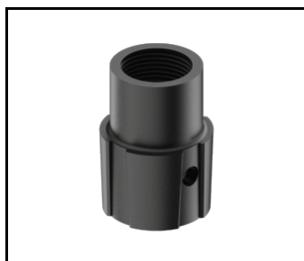
SKVER R female adapter thread 1 inch x40 (gas) (804441)