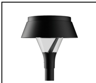
SKVER Hood ULR example 2 RAL9005 (421518)