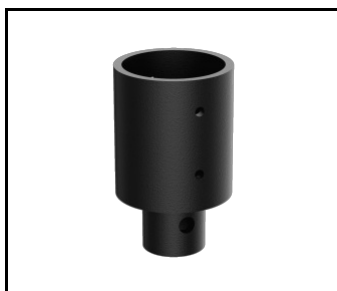
SKVER external adapter fi60 (804588)