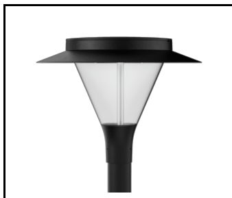
SKVER Hood example 1 RAL9005 (435522)