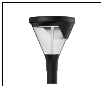
SKVER Backshield RAL9005 (435515)