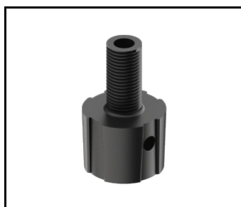
SKVER R male adapter thread M20x40 (pitch 2.5) (804427)