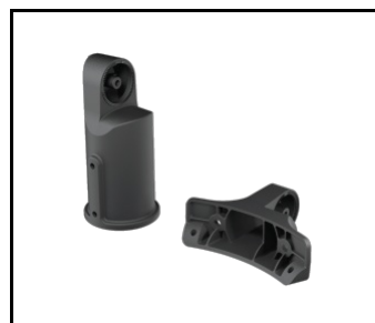
SKVER R Adjustable handle Dark Sky black (804618)