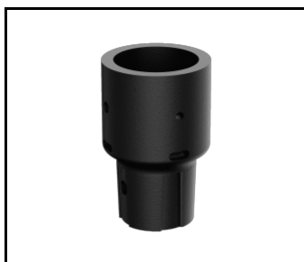
SKVER external adapter fi48 (804571)