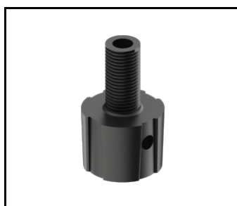
SKVER R male adapter thread M20x40 (pitch 2.5) (804427)