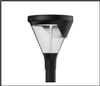
SKVER Backshield RAL9005 (435515)