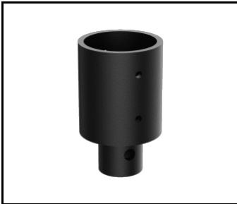
SKVER external adapter fi60 (804588)