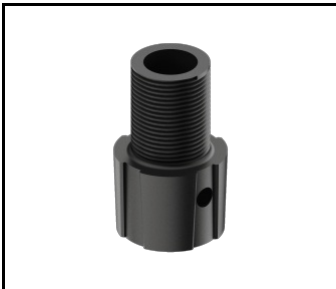
SKVER R male adapter thread 1 inch x40 (gas) (804434)