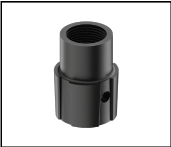
SKVER R female adapter thread 1 inch x40 (gas) (804441)