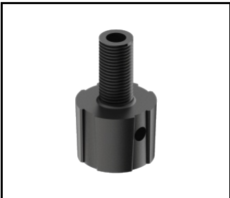
SKVER R male adapter thread M20x40 (pitch 2.5) (804427)