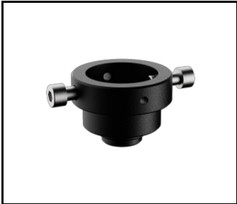
Drilling pattern (449017)