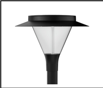
SKVER Hood example 1 RAL9005 (435522)