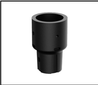
SKVER external adapter fi48 (804571)