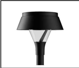
SKVER Hood ULR example 2 RAL9005 (421518)