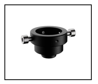
Drilling pattern (449017)