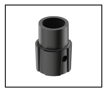
SKVER R female adapter thread 1 inch x40 (gas) (804441)