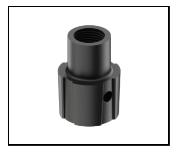
SKVER R female adapter thread 3/4 inch x 40 (gas) (804335)