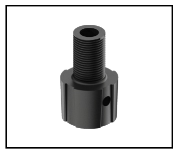
SKVER R male adapter thread \frac{3}{4} inch x 40 (gas) (804328)