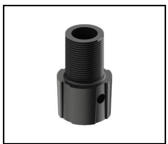
SKVER R male adapter thread 1 inch x40 (gas) (804434)