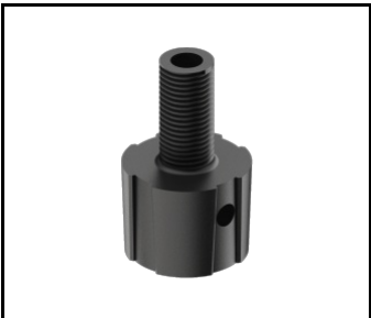
SKVER R male adapter thread M20x40 (pitch 2.5) (804427)