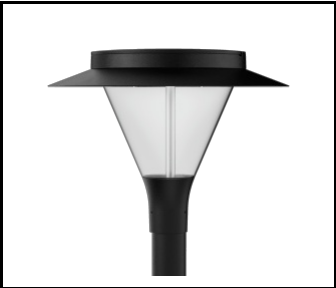
SKVER Hood example 1 RAL9005 (435522)