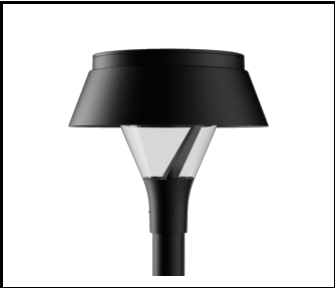
SKVER Hood ULR example 2 RAL9005 (421518)