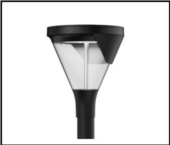
SKVER Backshield RAL9005 (435515)