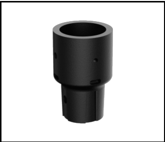
SKVER external adapter fi48 (804571)