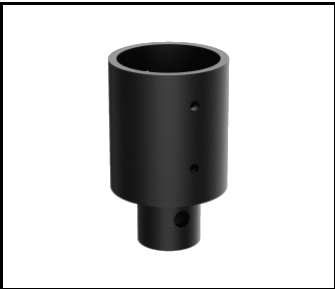
SKVER external adapter fi60 (804588)